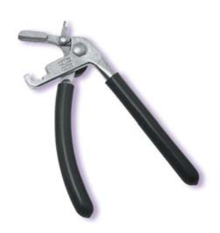
Part No. 0020